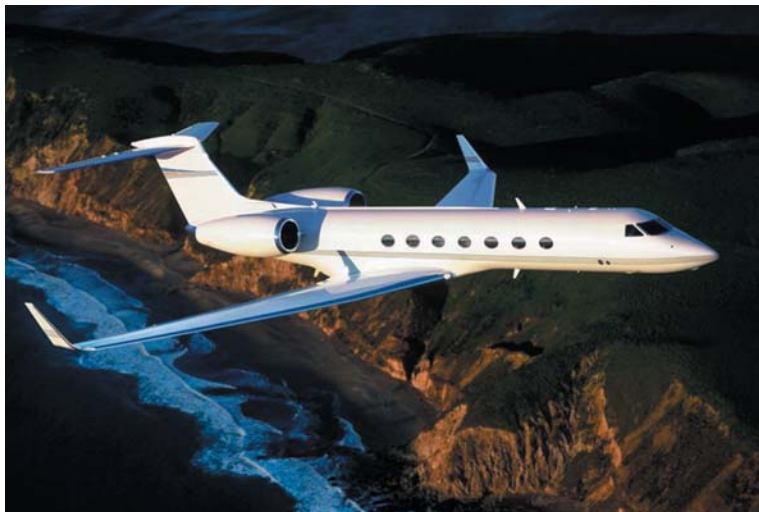
Fig. 1 — Gulfstream aircraft utilizes a porous metal filter in a critical turbofan application.

Over the past ten years, these flight-certified filters have become standard equipment. One such filter design features a media grade 60 sintered metal porous cup of Inconel 600. The porous cup is welded to a modified 304 stainless steel AN bulkhead union. Inconel 600 was chosen because it allows the filter to be easily retrofitted into the aircraft engine's eighth stage bleed air ducting system. It also has the requisite corrosion and temperature resistance, and can be welded for a permanent, leak-free and vibration-tolerant attachment into a standard tube fitting for ease of assembly. The filter assembly also needed to have the unique characteristic of sufficiently low pressure drop to ensure