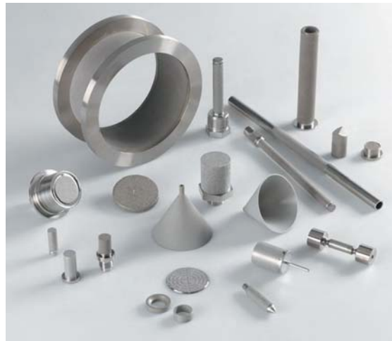
Fig. 3 — Examples of fabricated products made from sintered metal powder media.

Flight applications can also exploit other attrib-